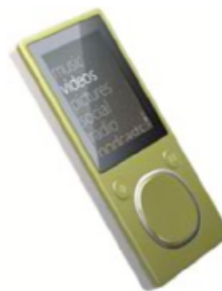
Microsoft Zune® 8GB MP3 Video Player